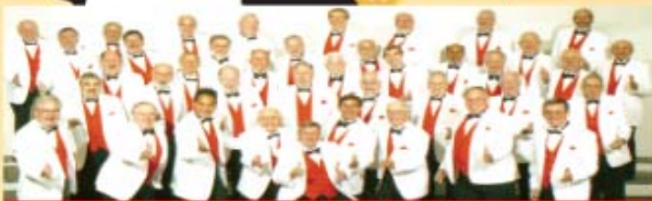
The Orange Empire Chorus